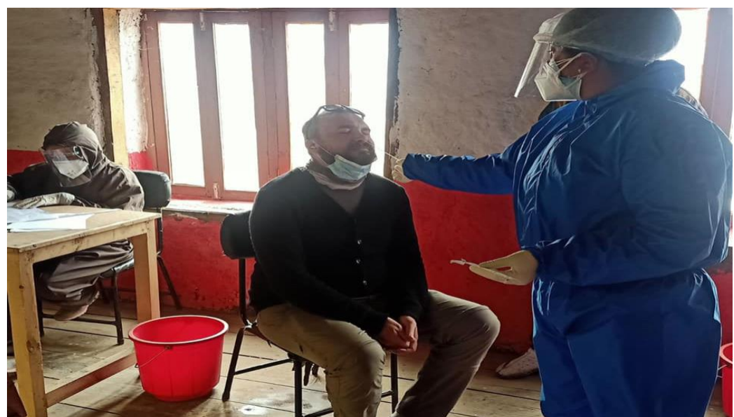
Testing the Samples, Chhengur, Baragung

Positivity Rate of COVID-19 at 9.45% in communities of Baragung Muktichhetra, Mustang