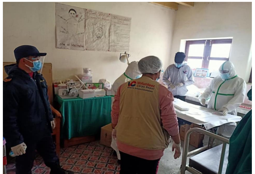
Tests being carried out in Kagbeni in the presence of Nepal Police

Our Vision can bring a Huge Smile- "Hands for all from High Himalayas to Plain of Terai."