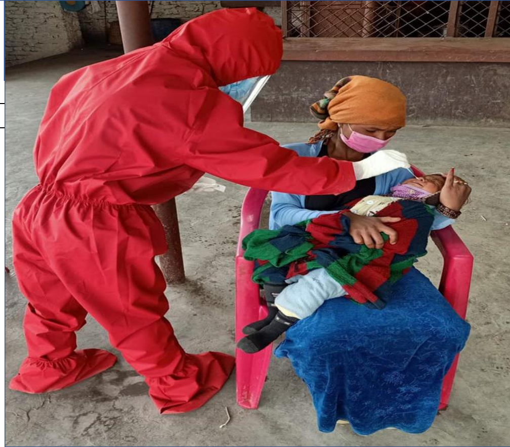
An Individual Being Tested in Chhengur, Baragung