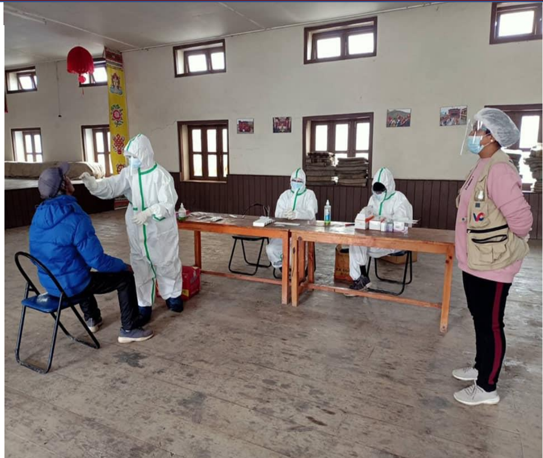
Mass Testing in Jharkot, Bungung