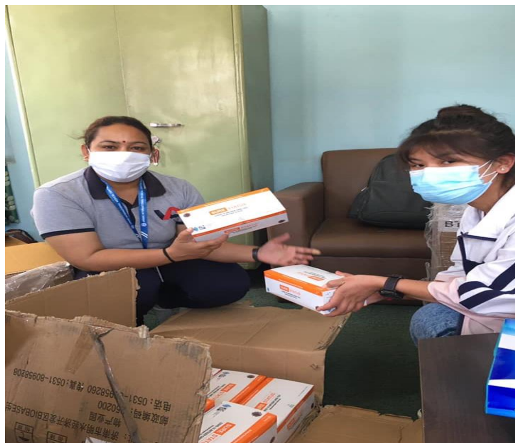
Organization of Commodities Prior to the Trip to Mustang