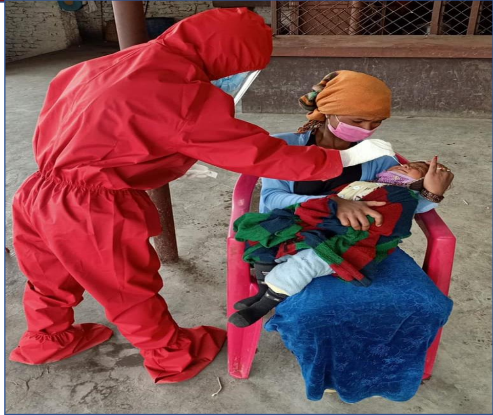
Testing a Toddler in RaniPauwa, Baragung

The campaign was taken to floor by testing the individuals of Ranipauwa for the initial two days. Testing of 400 individuals gave 44 positive test results. On third day, our team moved to Kagbeni Health Post where 11 people participated and 3 got positive test results. On the same day, 90 individuals were tested in Jharkot out of which 10 were found to be infected. 102 people of Chhengur were tested on the last day of campaign where 1 tested positive for the virus. This gave us the total of 603 tests and 57 positive cases of COVID-19 in the Baragung Muktichhetra Rural Municipality, Mustang .