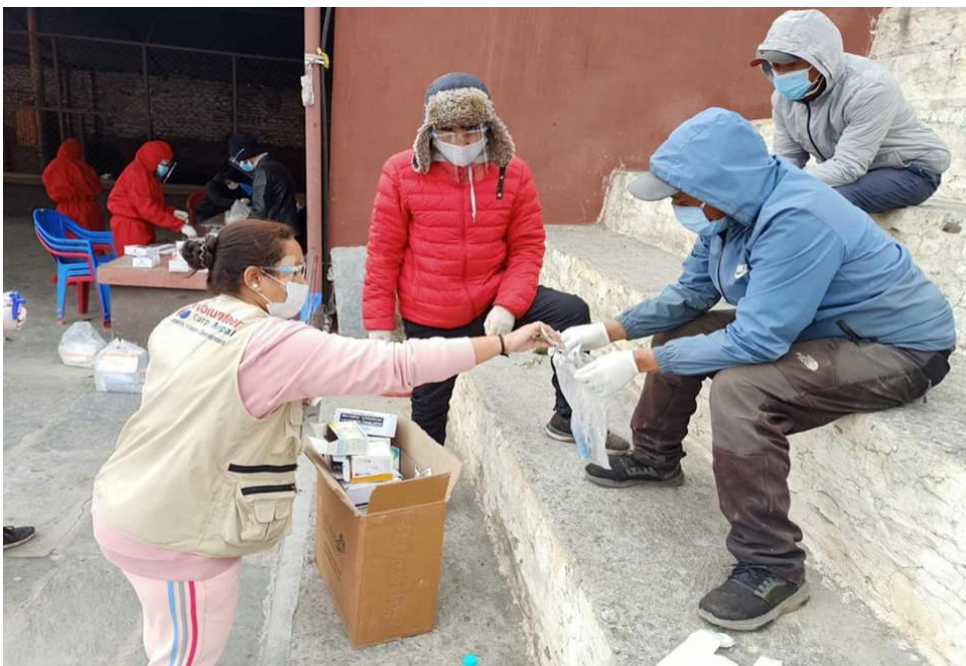
Distribution of medicines, Ranipauwa