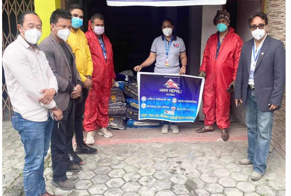
The Response Team

Volunteer Corps Nepal Buddhanagar-10, Baneshwor, Kathmandu Nepal Email: Connect@volunteercorpsnepal.org Contact: 9851093346