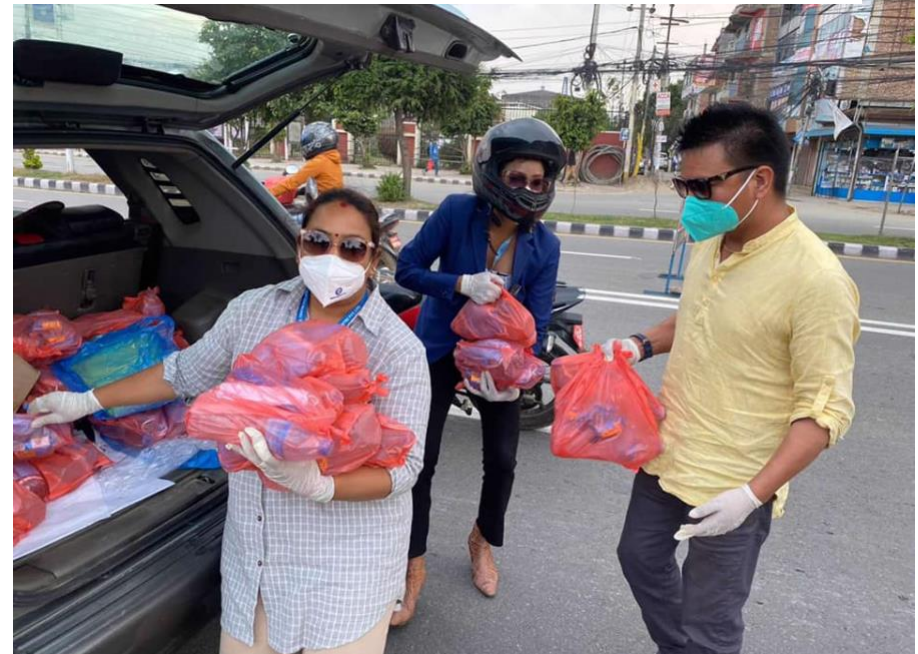
Distribution of snacks to pedestrians, Chakrapath