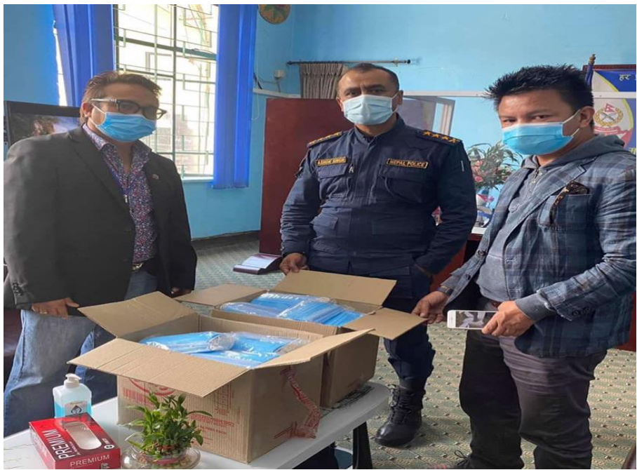
Handing over masks to Nepal Police, Kalimati