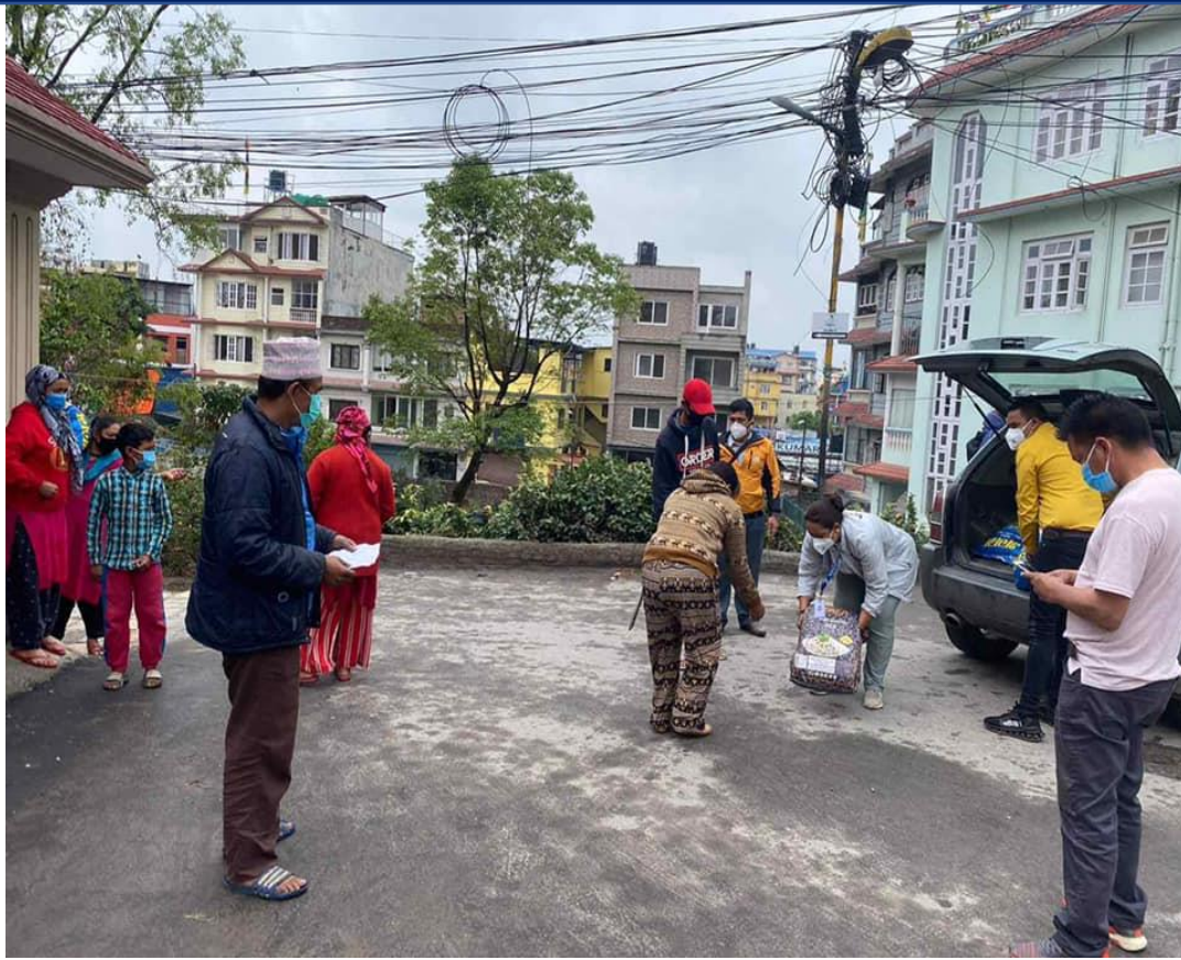
Handing the Food Package to a Resident in Thimi, Bhaktapur