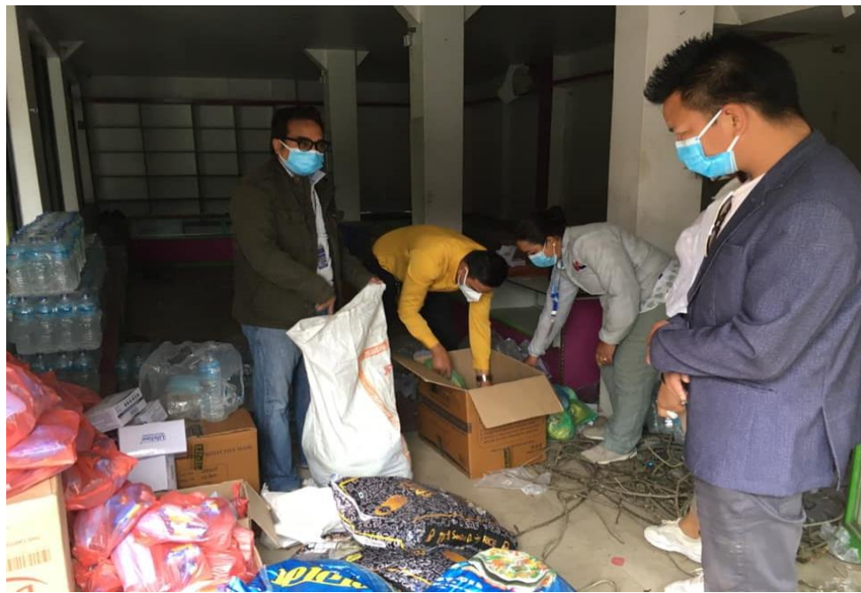
Packaging of Relief Materials